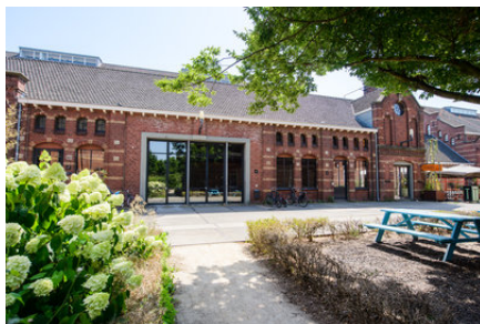
Zuiveringshal Oost Westergas, Amsterdam